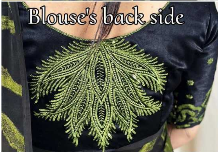
Blouse's back side