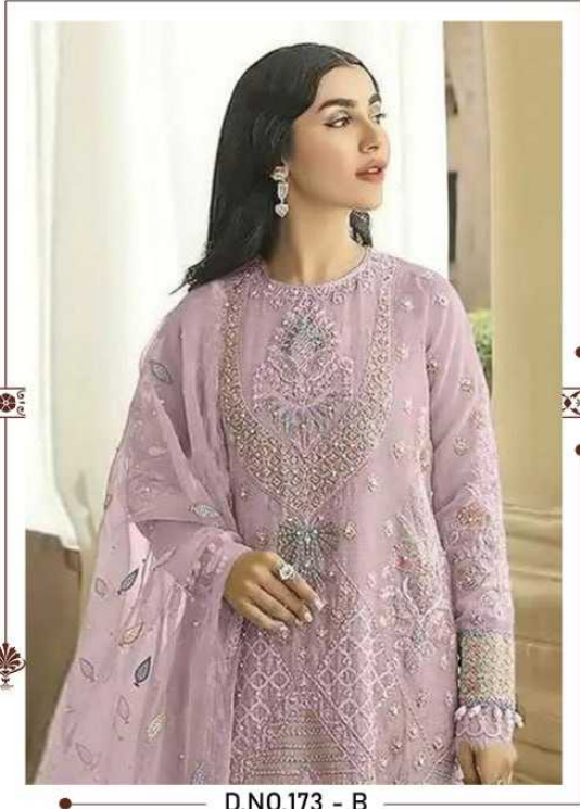
D.NO.173 - B

TOP - GEORGETTE WITH EMBROIDERY WORK WITH KHATLI WORK BOTTOM - DULL SANTOON DUPATTA - GEORGETTE WITH EMBROIDERY WORK INEER - DULL SANTOON