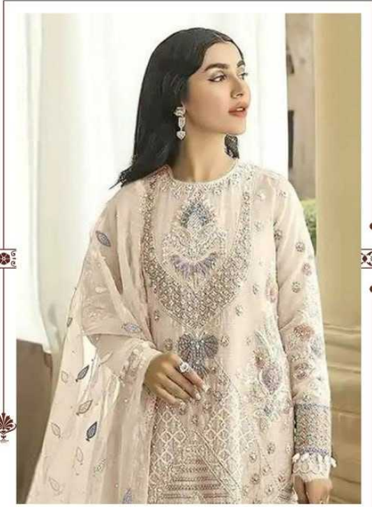
D.NO.173 - D

TOP - GEORGETTE WITH EMBROIDERY WORK WITH KHATLI WORK BOTTOM - DULL SANTOON DUPATTA - GEORGETTE WITH EMBROIDERY WORK INEER - DULL SANTOON