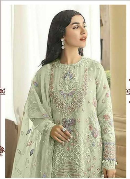
D.NO.173 - A

TOP - GEORGETTE WITH EMBROIDERY WORK WITH KHATLI WORK BOTTOM - DULL SANTOON DUPATTA - GEORGETTE WITH EMBROIDERY WORK INEER - DULL SANTOON