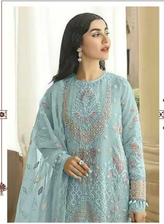
D.NO.173 - C

TOP - GEORGETTE WITH EMBROIDERY WORK WITH KHATLI WORK BOTTOM - DULL SANTOON DUPATTA - GEORGETTE WITH EMBROIDERY WORK INEER - DULL SANTOON