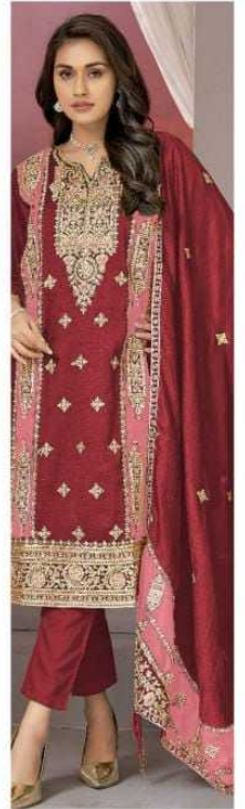
D.NO.168 - D