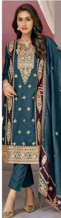
D.NO.168 - A