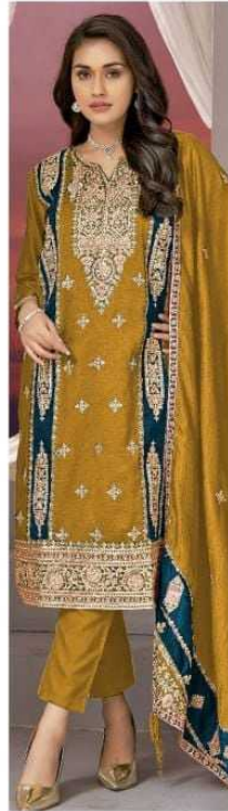
D.NO.168 - B