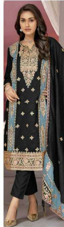
D.NO.168 - C