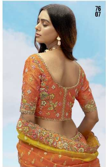
"A lehenga whispers tales of bygone eras, of princesses and queens, while embracing the spirit of modern divas."