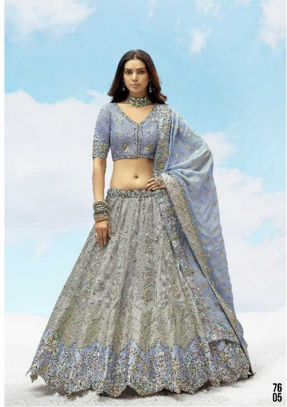
A lehenga is an invitation to embrace your femininity, to celebrate your culture, and to dance to the rhythm of your own heart