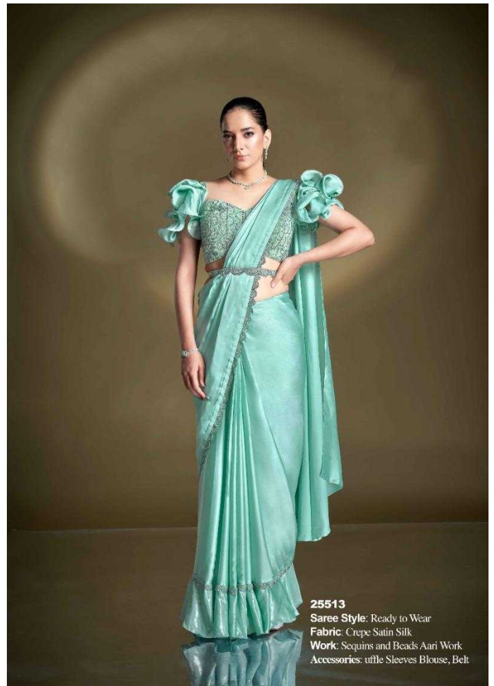
25513 Saree Style: Ready to Wear Fabric: Crepe Satin Silk Work: Sequins and Beads Aari Work Accessories: tulle Sleeves Blouse, Belt