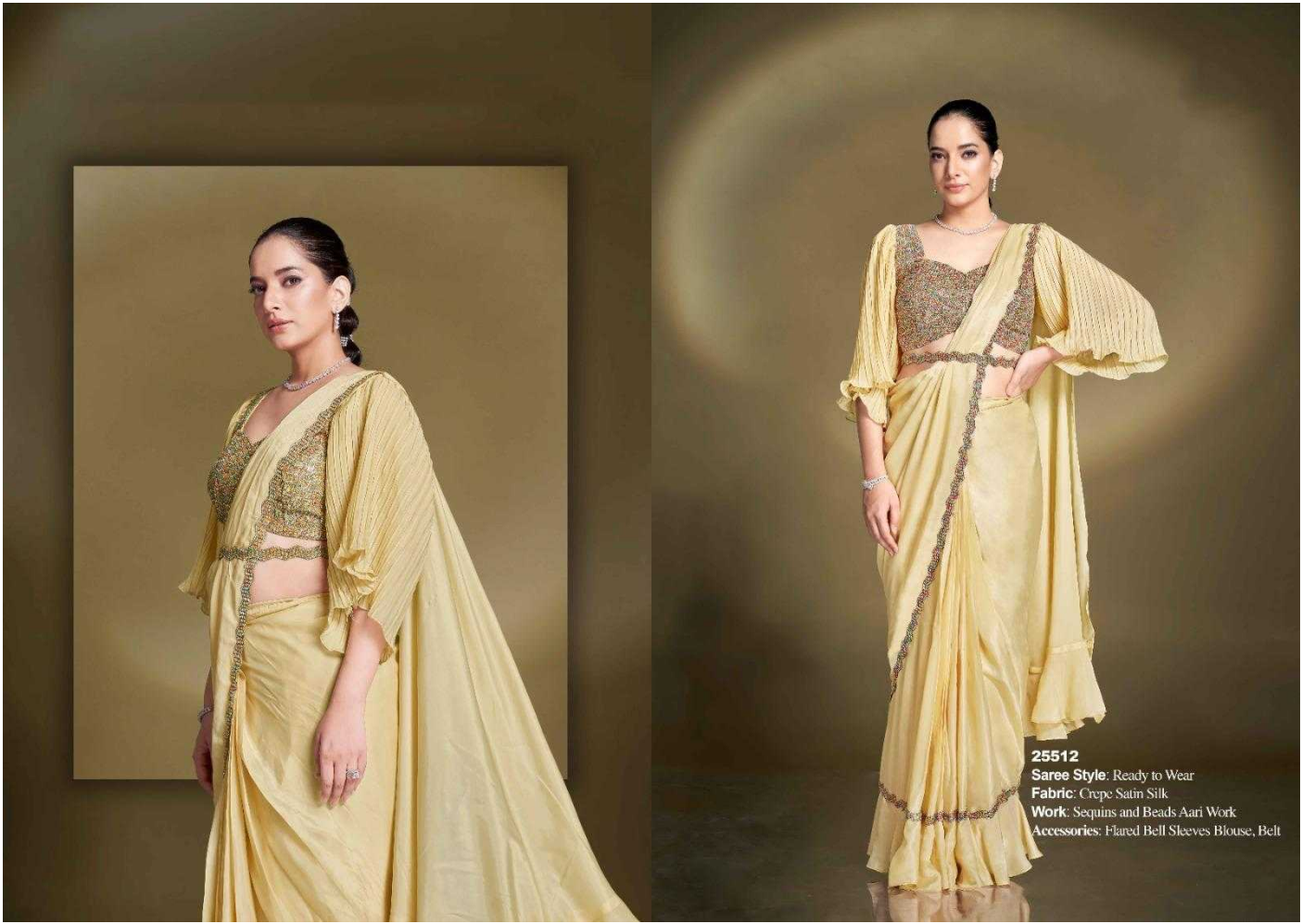
25512 Saree Style: Ready to Wear Fabric: Crepe Satin Silk Work: Sequins and Beads Aari Work Accessories: Flared Bell Sleeves Blouse, Belt