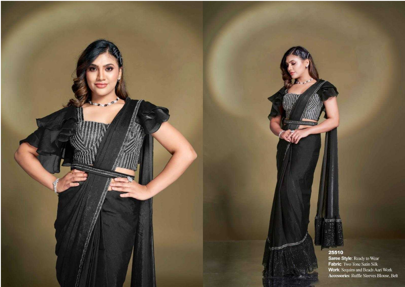
25510 Saree Style: Ready to Wear Fabric: Two Tone Satin Silk Work: Sequins and Beads Aari Work Accessories: Ruffle Sleeves Blouse, Belt