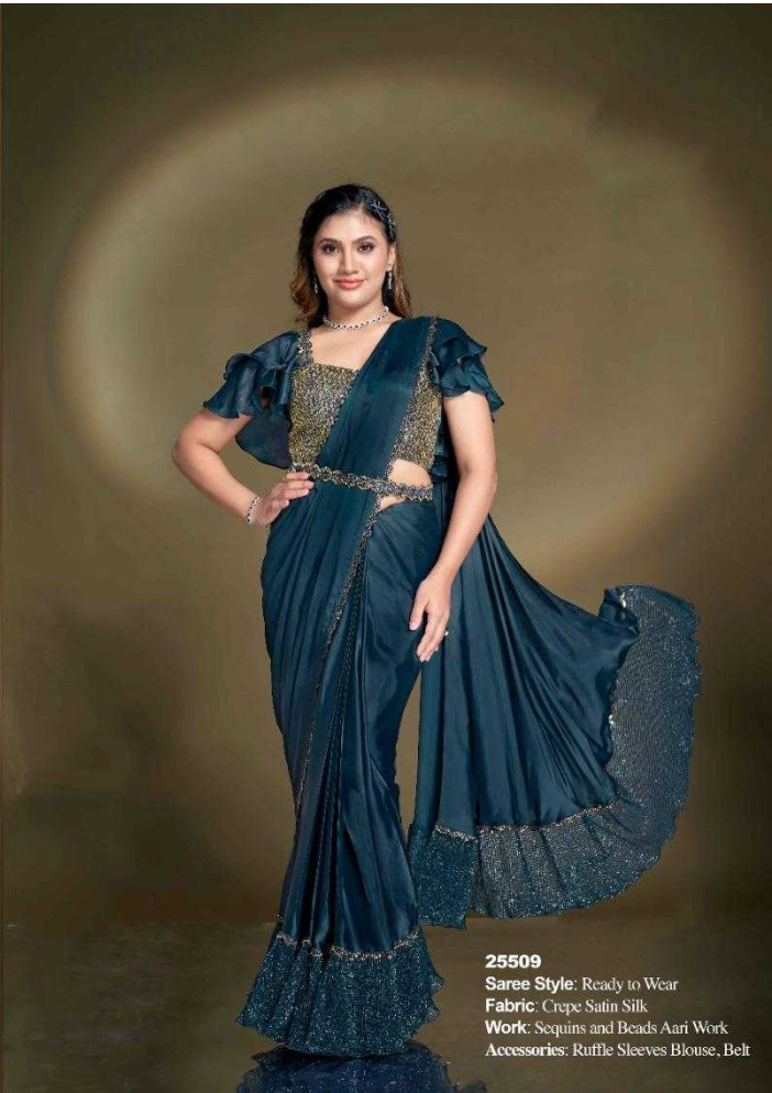
25509 Saree Style: Ready to Wear Fabric: Crepe Satin Silk Work: Sequins and Beads Aari Work Accessories: Ruffle Sleeves Blouse, Belt