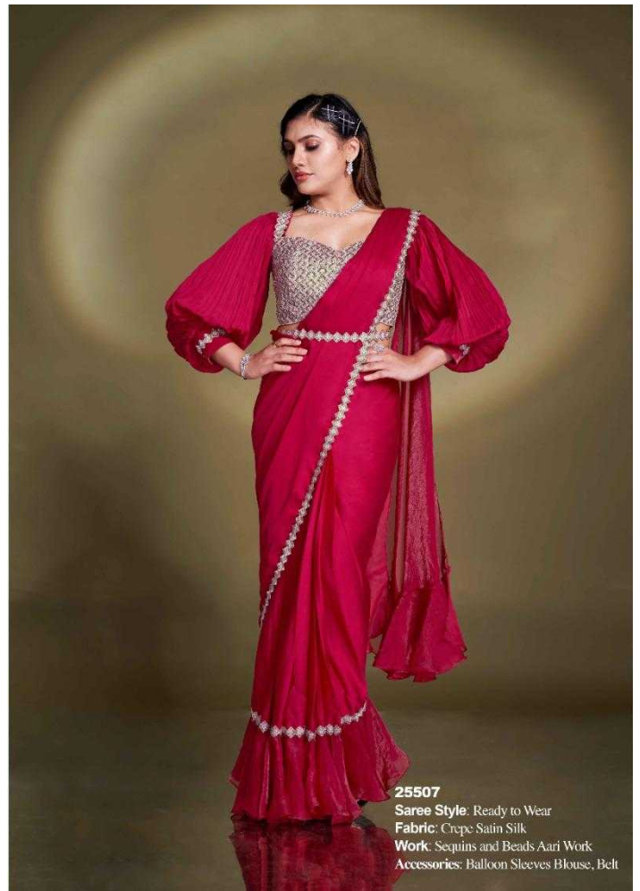
25507 Saree Style: Ready to Wear Fabric: Crepe Satin Silk Work: Sequins and Beads Aari Work Accessories: Balloon Sleeves Blouse, Belt