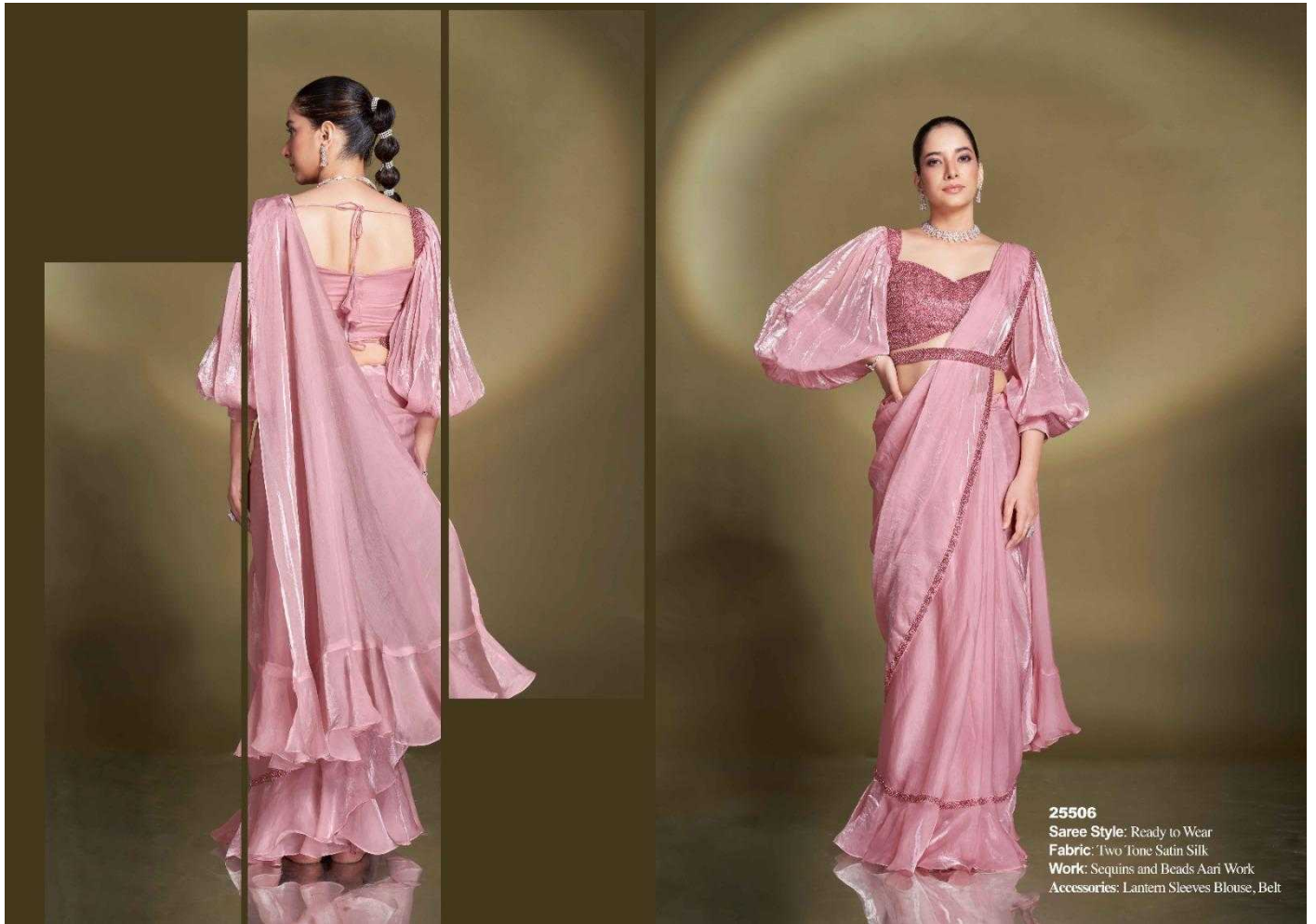
25506 Saree Style: Ready to Wear Fabric: Two Tone Satin Silk Work: Sequins and Beads Aari Work Accessories: Lantern Sleeves Blouse, Belt