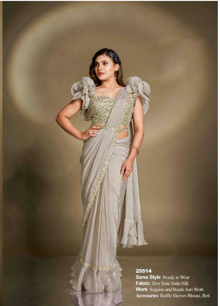
25514 Saree Style: Ready to Wear Fabric: Two Tone Satin Silk Work: Sequins and Beads Aari Work Accessories: Ruffle Sleeves Blouse, Belt